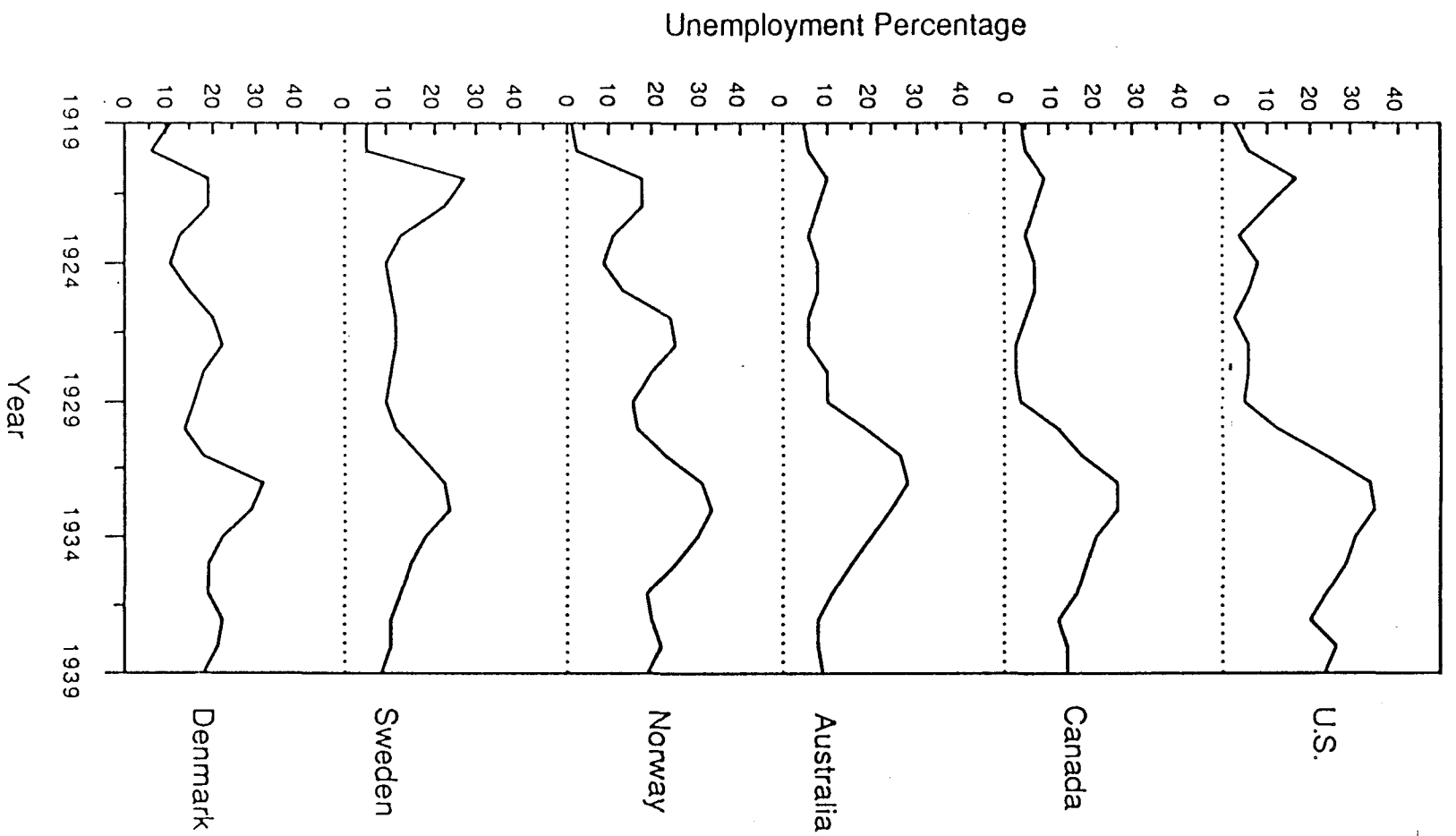
Fig 1.1 Industrial Unemployment Rates, 1919-1939